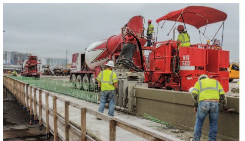
Work continued around the clock on TDOT's "Fast Fix 8" project.