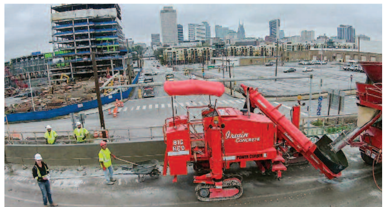
Working in the shadow of downtown Nashville, the Irwin team works on the Interstate 40 bridge over Charlotte Avenue.

"Without the Power Curber we would never have been able to meet such tight deadlines. The job would have been impossible if we'd had to handform all those walls," he said.