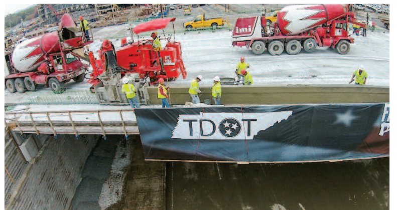
Irwin's crew poured approximately 3,000 feet of barrier and parapet on I-40, southwest of Nashville.