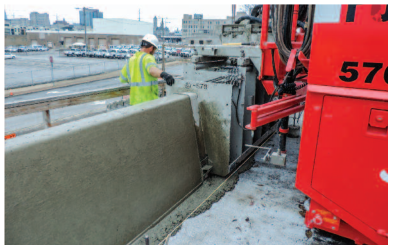
The Irwin crew poured 35" side parapet and 32" median barrier on the newly constructed bridges.